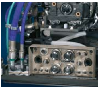
engine pallet side